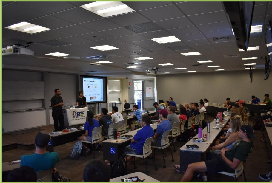
A packed room of students learning about Kimley-Horn on 9/28

General Meetings 192-106 | 11 AM-12 PM | Lunch Provided 10/12 Wallace Group | 10/19 Econolite | 10/26 Kittelson & Associates | 11/14 US Forest Service